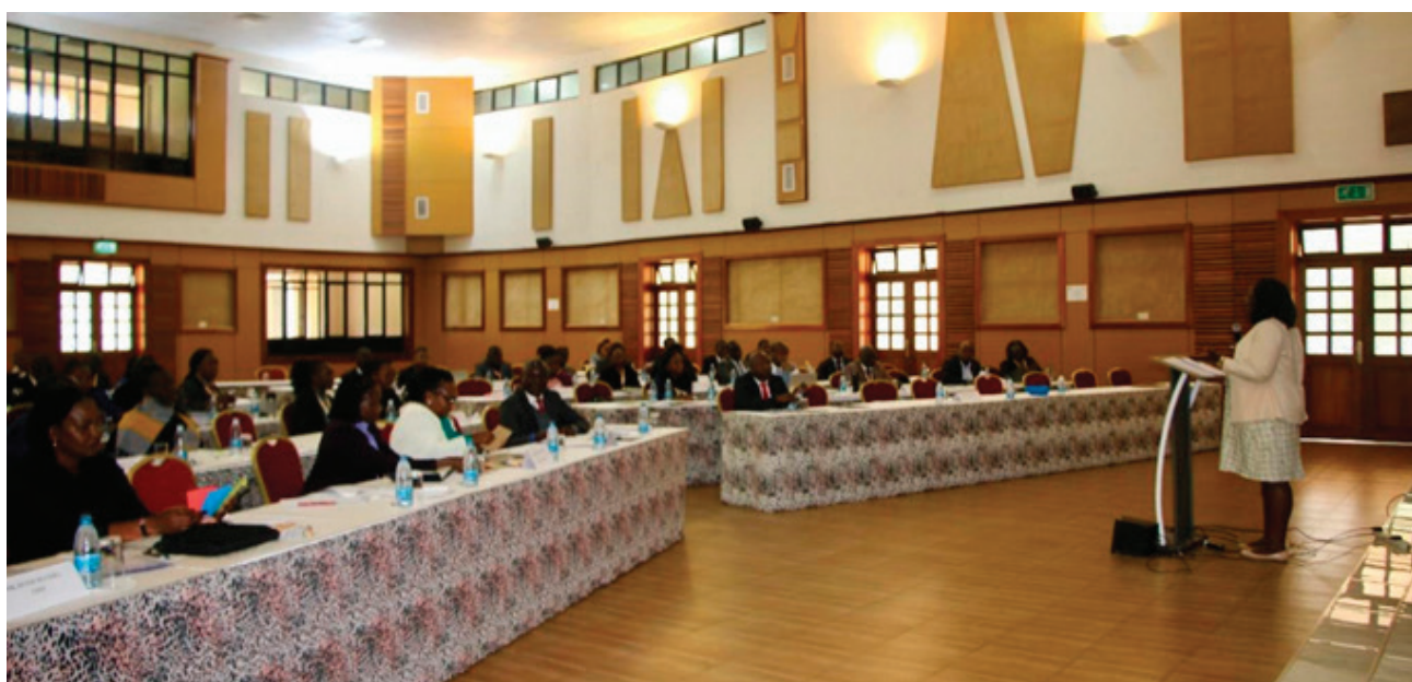
Participants follow a presentation during the training on Managing Legislative Committees