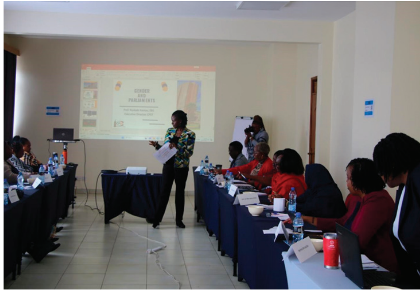
Photo 2. Caption 2. The Executive Director CPST, Prof Nyokabi Kamau EBS while facilitating a session on Gender and Parliaments during the training on enhancing the legislative capacity of women Members of the County Assembly of Kitui

"Enhancing the legislative capacity of our women Members is not only crucial for the success of the Assembly, but also for empowerment of women across the county. This training ensures that our female leaders are better prepared to represent their