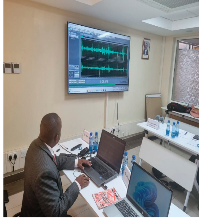
Caption 4. Participants undertaking a session on audio production in the advent of Artificial Intelligence.